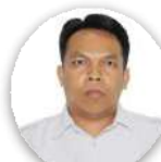
Capt. Anggiat PTP Pandiangan SSIT National Transportation Safety Committee (KNKT)